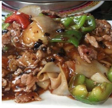
beef chowfun with black bean sauce