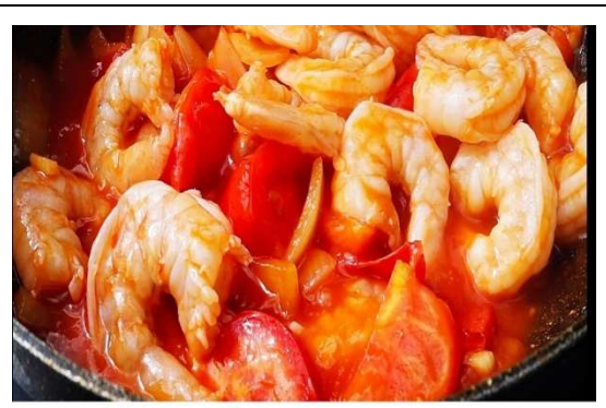
Shrimp with fresh tomatos