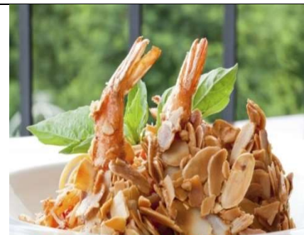
DEEP FRIED ALMOND PRAWNS