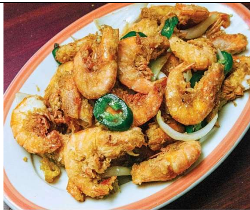
Peppercorn shrimp with shallots