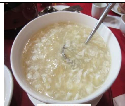
FISH MAW SOUP