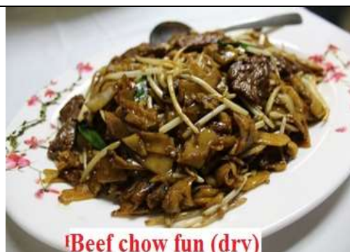
Beef chow fun (dry)