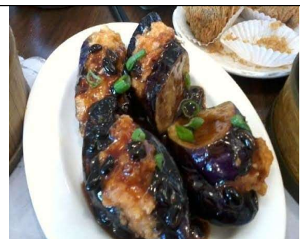
stuffed eggplant with black bean sauce