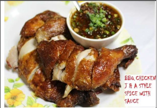
BBQ CHICKEN J & A STYLE SPICE WITH SAUCE