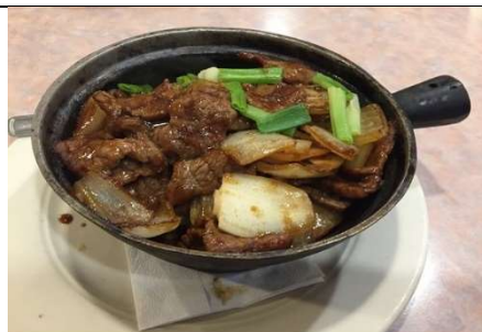
BEEF ONION GINGER HOTPOT