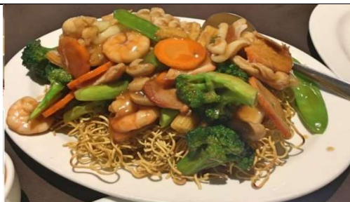
SPECIAL CANTONESE CHOW MAIN