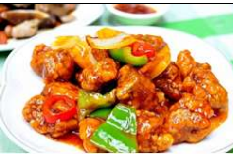
Sweet&Sour lean pork