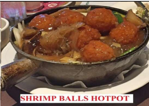
SHRIMP BALLS HOTPOT