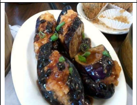
stuffed eggplant with black bean sauce