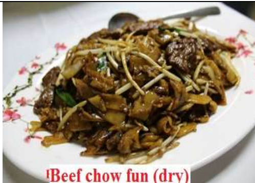
Beef chow fun (dry)