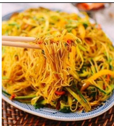
Singapore noodle with curry