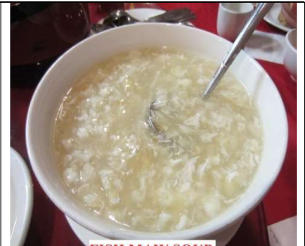
FISH MAW SOUP