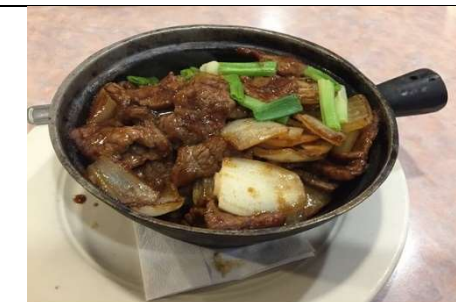
BEEF ONION GINGER HOTPOT