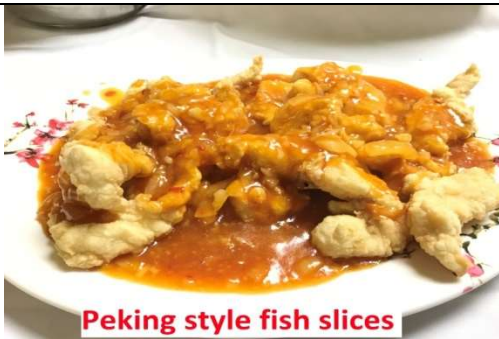
Peking style fish slices