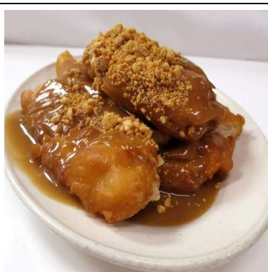
Almond Soo Gai