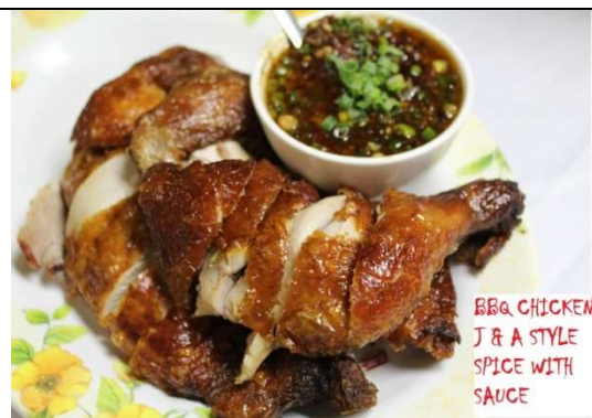
BBQ CHICKEN J & A STYLE SPICE WITH SAUCE