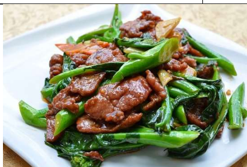
beef with kailan