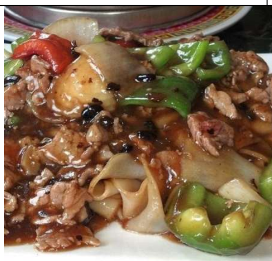
beef chowfun with black bean sauce