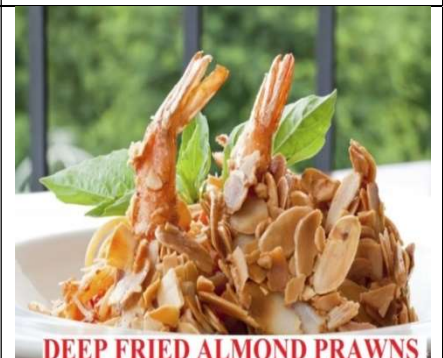
DEEP FRIED ALMOND PRAWNS