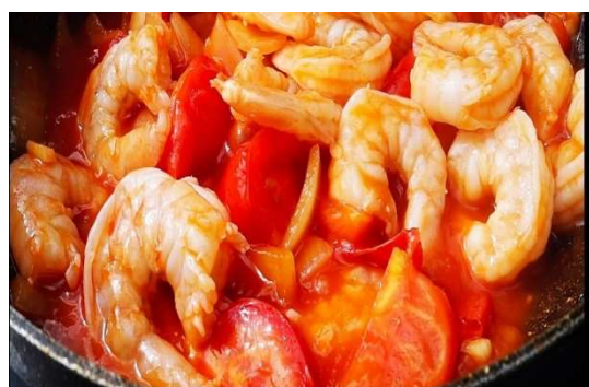
Shrimp with fresh tomatos