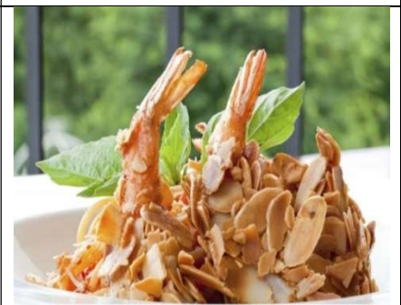
DEEP FRIED ALMOND PRAWNS