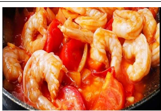
Shrimp with fresh tomatoes