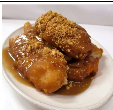
Almond Soo Gai