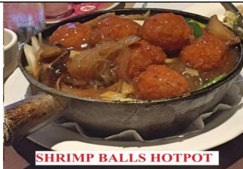
SHRIMP BALLS HOTPOT