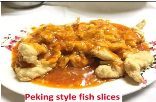
Peking style fish slices