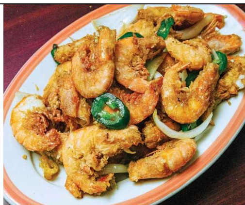
Peppercorn shrimp with shallots