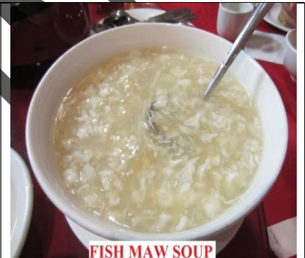
FISH MAW SOUP