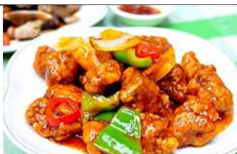
Sweet&Sour lean pork