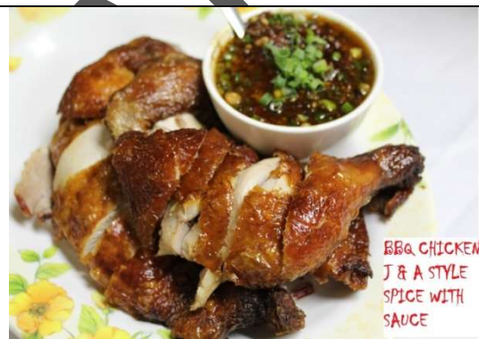
BBQ CHICKEN J & A STYLE SPICE WITH SAUCE